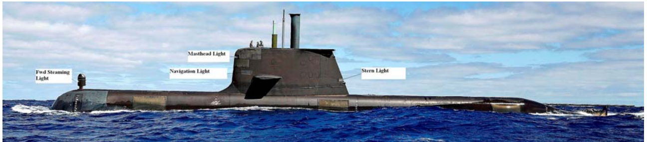
Collins Class submarine illustrating typical navigation light configuration. The Collins Class will be progressively modified with the masthead light to be fitted atop the radar mast.

8. Australian Collins Class submarines exhibit a very quick flashing yellow identification light (120 flashes per minute) VQ.Y. This identification light should not be confused with an air cushion vessel operating in a non-displacement mode which displays the same light.