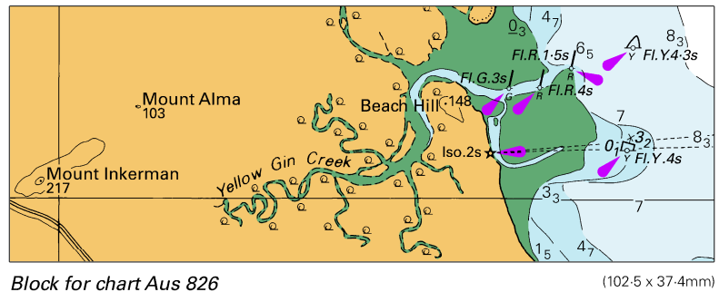
Block for chart Aus 826